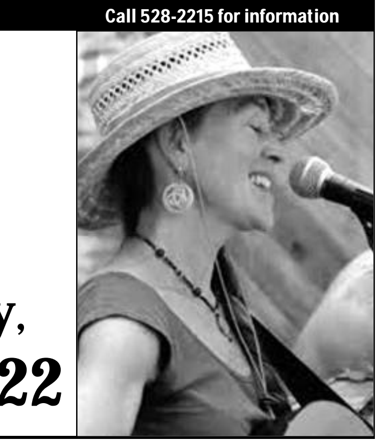
Community Unitarian Universalist Church 2819 W. Sylvester St., Pasco