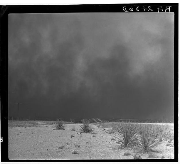
Just a Dust Bowl Refuge