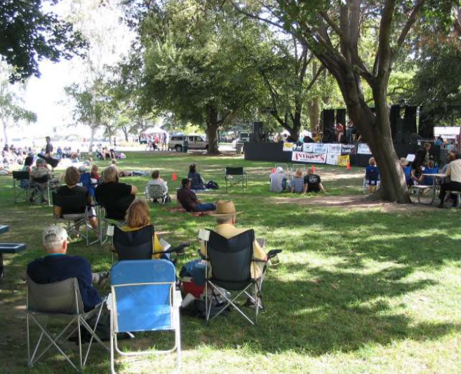
TMF — the place to be for fine music and song