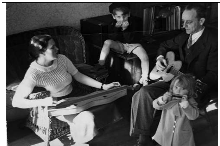
The Seegers: Ruth Crawford Seeger, Mike Seeger, Peggy Seeger and Charles Seeger, in a photo circa 1937

More information can be found in "A Short History of the Appalachian Dulcimer" http://www.bearmeadow.com/dulcimer-history/index.html and in "Some Historical Notes on the Mountain Dulcimer" "http://www.gilamountaindulcimers.com/pete.htm" Google away, there's lots more out there.